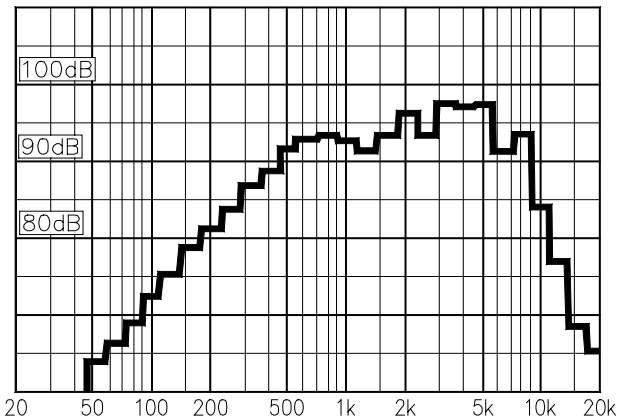
1W/1m Pink Noise 1/3 octave bands